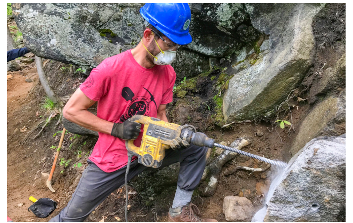
The Taconic Crew built steps along the Undercliff Trail to provide a safe route for Breakneck hikers.

As my fellow Taconic Trail Crew members and I closed out our last week together, we finished up several key