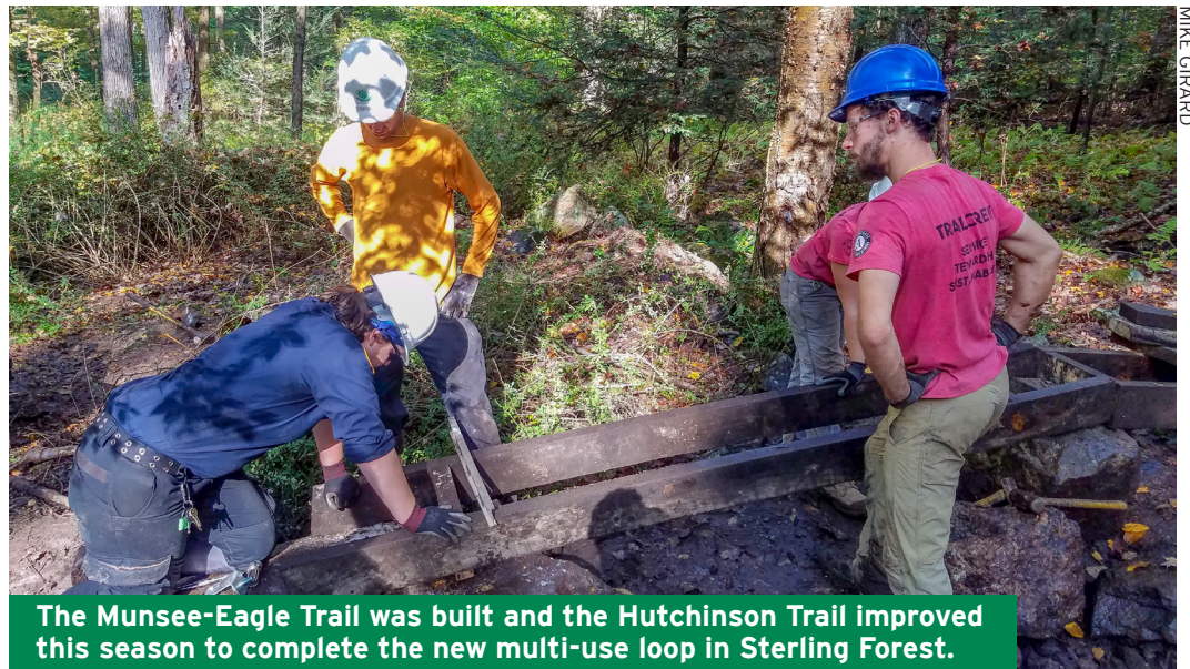
The Munsee-Eagle Trail was built and the Hutchinson Trail improved this season to complete the new multi-use loop in Sterling Forest.

The Trail Conference and New York State Parks held a grand opening of a 7-mile, multi-use, single-track trail loop at Sterling Forest State Park on Sept. 30. The ribbon-cutting was followed by a guided ride, trail run, and hike beginning on the Munsee-Eagle and returning on the Hutchinson Trail. About 50 crew members, volunteers, partners, and supporters attended the momentous event. Trail Conference staff and volunteers began work on the new multi-use trail loop in October 2015. Since then, a small army of Trail Conference volunteers and Conservation Corps members has given more than 13,000 hours constructing the Munsee-Eagle/Hutchinson/Red Back loop.