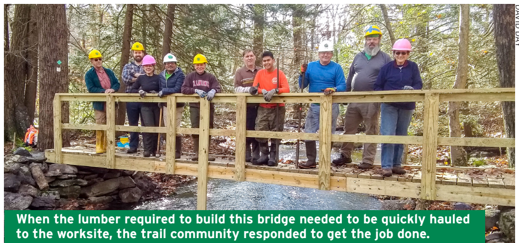
When the lumber required to build this bridge needed to be quickly hauled to the worksite, the trail community responded to get the job done.