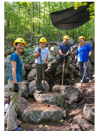
Vista Loop Trail at Ramapo Valley County Reservation

The Trail Conference now fields several Corps crews every season. Our Conservation Corps trains the next generation of environmental stewards to preserve the integrity of trails and natural areas and engage volunteers to inspire a deeper appreciation for the care that open space requires. Get involved at nynjtc.org/corps .