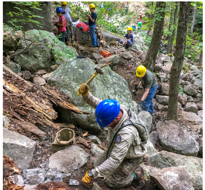
Volunteers, Corps members, and professional trail builders all contributed to rehabilitation efforts.

roughly 1,300 steps since the Bear Mountain Trails Project began, the most ambitious rehabilitation of the Appalachian Trail ever conducted is complete. Thank you to everyone who was part of this journey and helped make it happen!