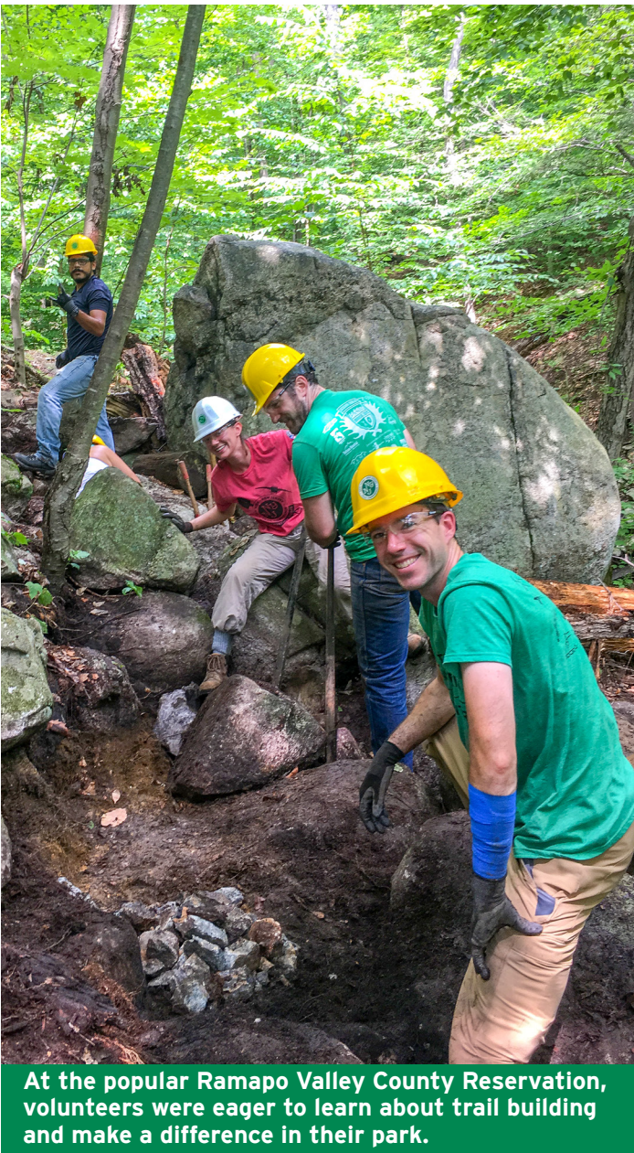
At the popular Ramapo Valley County Reservation, volunteers were eager to learn about trail building and make a difference in their park.