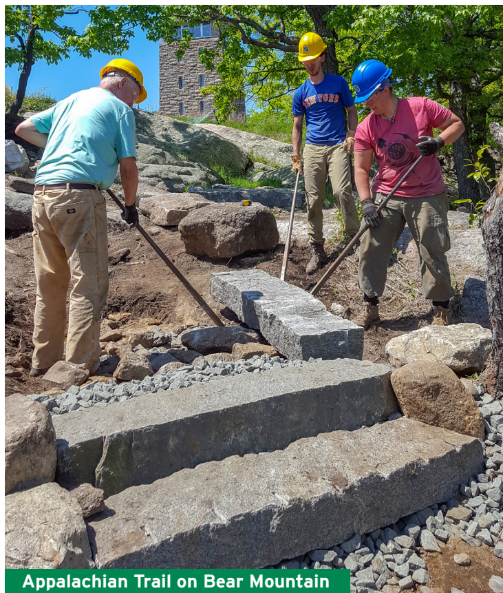
Appalachian Trail on Bear Mountain

The Project of the Year Award celebrates the important services Corps provide to communities and young people across the country. Projects of the Year are innovative and demonstrate a Corps' ability to give Corps members a positive experience and provide the community with meaningful improvements. The Trail Conference will receive this prestigious honor at The Corps Network's annual National Conference in Washington, D.C., in February.