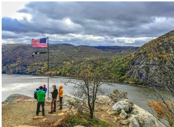
The Trail Conference and partners took part in Hot Spot Week to better the stewardship of Breakneck.

The week kicked off with a Breakneck site visit and assessment by the the Traveling Trainers and partners responsible for managing the mountain and its trails, including NYS Parks and the Trail Conference. Partners then took part in Leave No Trace communications training, and the Trail Conference hosted an REI-sponsored Trail Chat with land managers and other partners invested in protecting open space. We worked to identify actions needed to mitigate the effects of the impacts from high-use at Breakneck