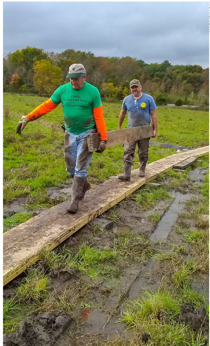
The West Jersey Crew worked six weekends replacing planking on the Pochuck section of the A.T.

We thank the Appalachian Trail Conservancy for awarding the grant for this necessary project, and thank L.L.Bean for their generous Grants to A.T. Clubs program. We are also grateful for the support from Wawayanda State Park staff, and from the owner of the cattle that graze in “field 1” for graciously moving the cattle for most of our work days. A special thank you to the members of the West Jersey Crew, who returned week after week, got muddy, and worked hard until the job was done.