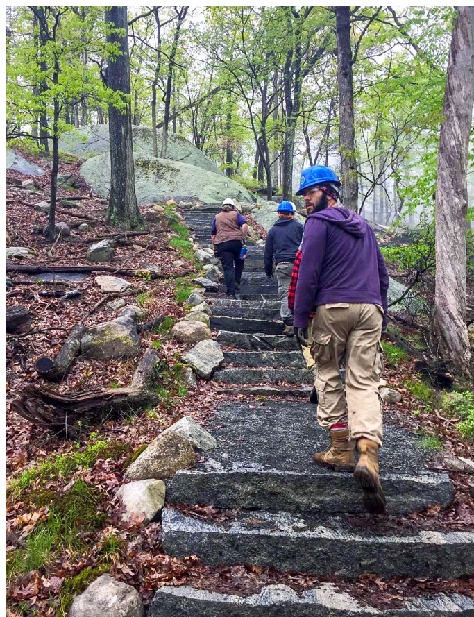
More than 1,300 stone steps were placed on Bear Mountain to make the Trail here sustainable.

It is hard to put into words what working on the Bear Mountain project has meant to me. When I joined the Corps in 2017, I was frustrated with how my life had been going. I stumbled upon a posting for a trail crew member with the Trail Conference and fell in love with trail work right away. I felt