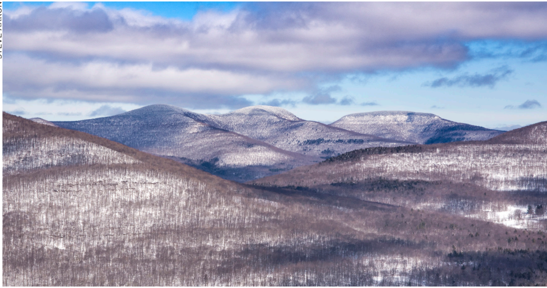
Trails make this view of the Blackhead Range in the Catskills possible! Support the Trail Conference and help us take you to beautiful places.