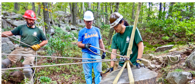
The LDTC had another successful season making the Appalachian Trail safe and sustainable.

Read more from the crew at longdistancetrailscrew.org .