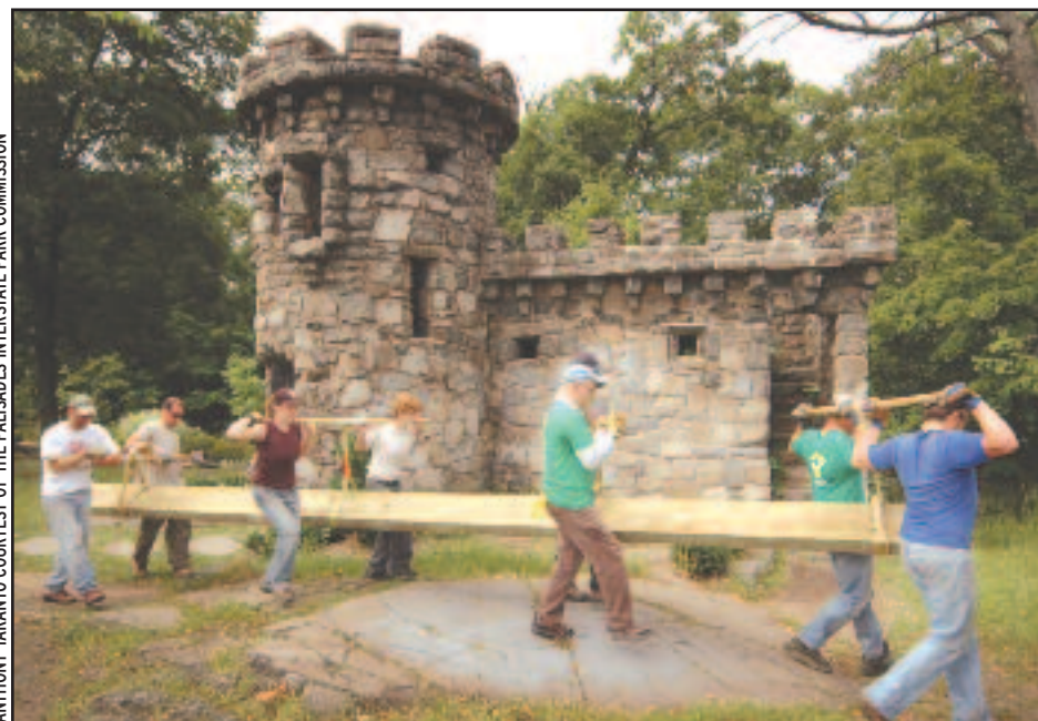
Volunteers helped Palisades State Park staff haul lumber to a work site in the fall.