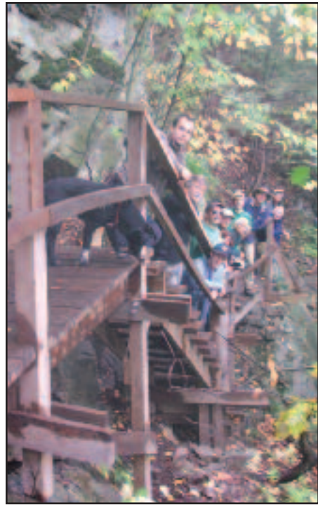
Volunteers line up on the completed Stillman Bridge.