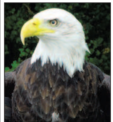
The 'Do Not Disturb' sign goes up for roosting eagles at George's Island

From January 1 through March, trails at George's Island Park in Westchester and Denning Point in Dutchess County will be closed to prevent disturbances at roosting sites of Bald Eagles. (See related story on page 7.)