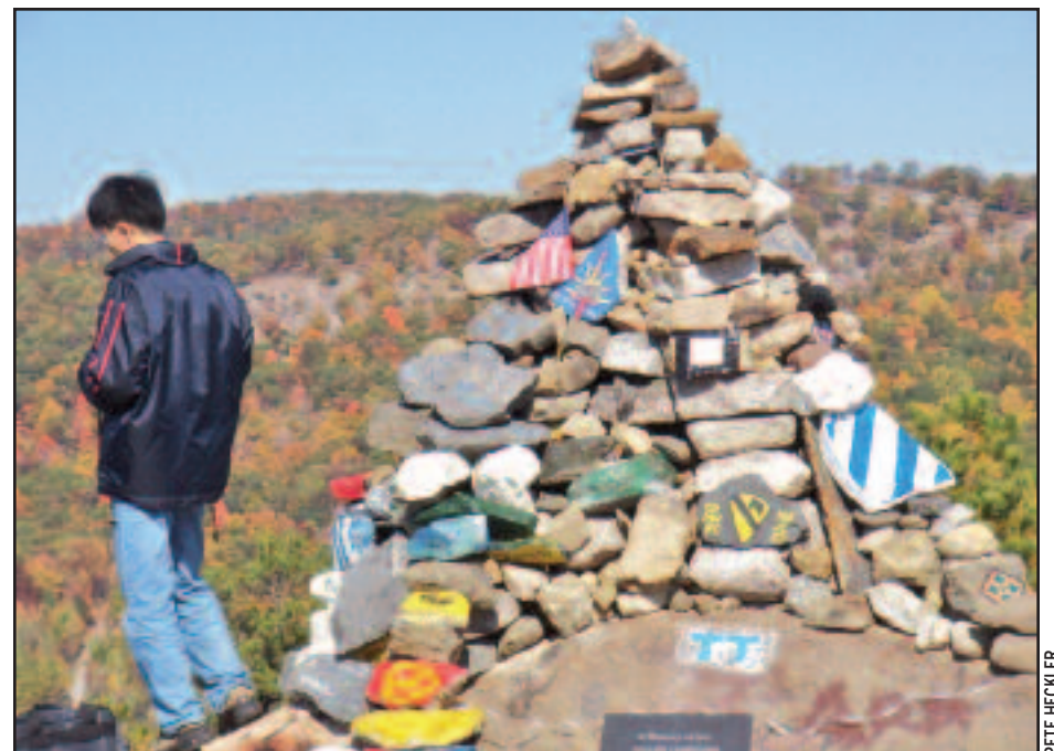
A cairn atop Popolopen Torne in Harriman State Park memorializes U.S. service people.