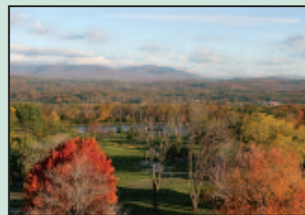
View of Shawangunk Ridge from New Paltz

A 650-acre parcel on the spine of the Shawangunk Ridge in Mamakating is the targeted site for a gated community of large luxury homes, a hotel, conference center, spa, and restaurants called Seven Peaks on Mountain Road. The land is directly above the Bashakill Wildlife Management Area and the Shawangunk Ridge Trail/Long Path, within sight of the Delaware and Hudson (D&H) Canal Trail on the western flank of the ridge, and includes headwater streams that feed the nearby Shawangunk Kill on the ridge's eastern flank. The project would be highly visible from both the Wallkill Valley to the east and the Neversink Highlands and the Bashakill to the west. At full build-out, Seven Peaks would be one of the largest developments ever proposed along