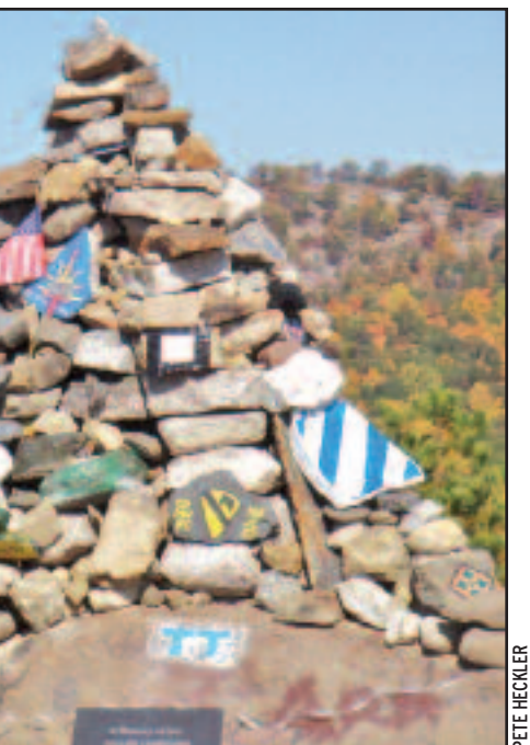
A cairn atop Popolopen Torne in Harriman State Park memorializes U.S. service people.