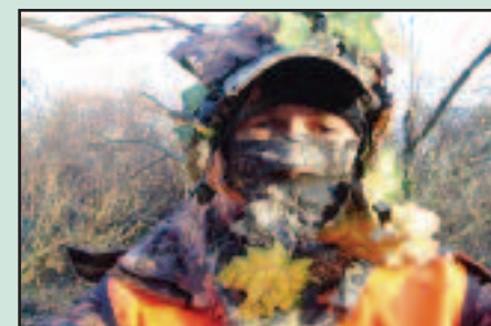
Sunday hiking at risk in New Jersey

The legislation currently in play would authorize bow and arrow deer hunting on Sundays in Wildlife Management Areas and private property in New Jersey. If approved by the NJ Legislature, this change in policy could result in complete closures on lands that already have extremely restricted hiking opportunities during hunting season. For example, the Newark Watershed lands are open to hikers only on Sundays from early October until early January, with other hunting related restrictions throughout the year. It seems likely that these Watershed lands would be closed to hiking on Sundays also if bow and arrow deer hunting on Sundays becomes legal.