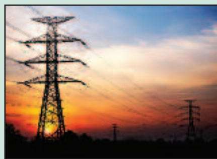
Coming soon to a trail near you?

Stay tuned for more action alerts and an update in the March/April TW .